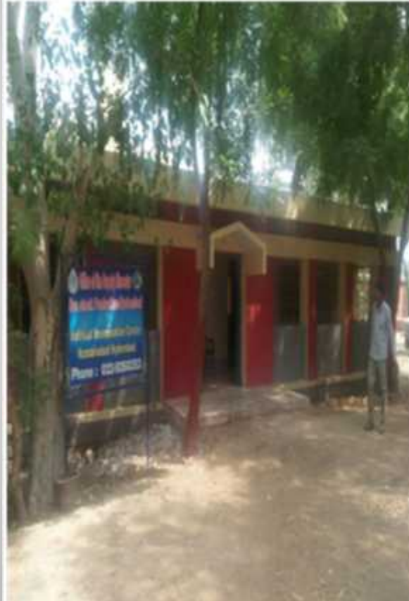
LPO HYDERABAD After Renovation