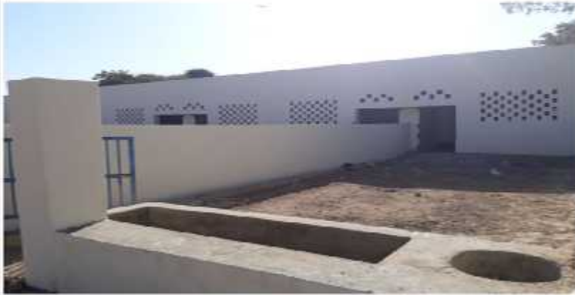
SEMEN PRODUCTION UNIT, KARACHI